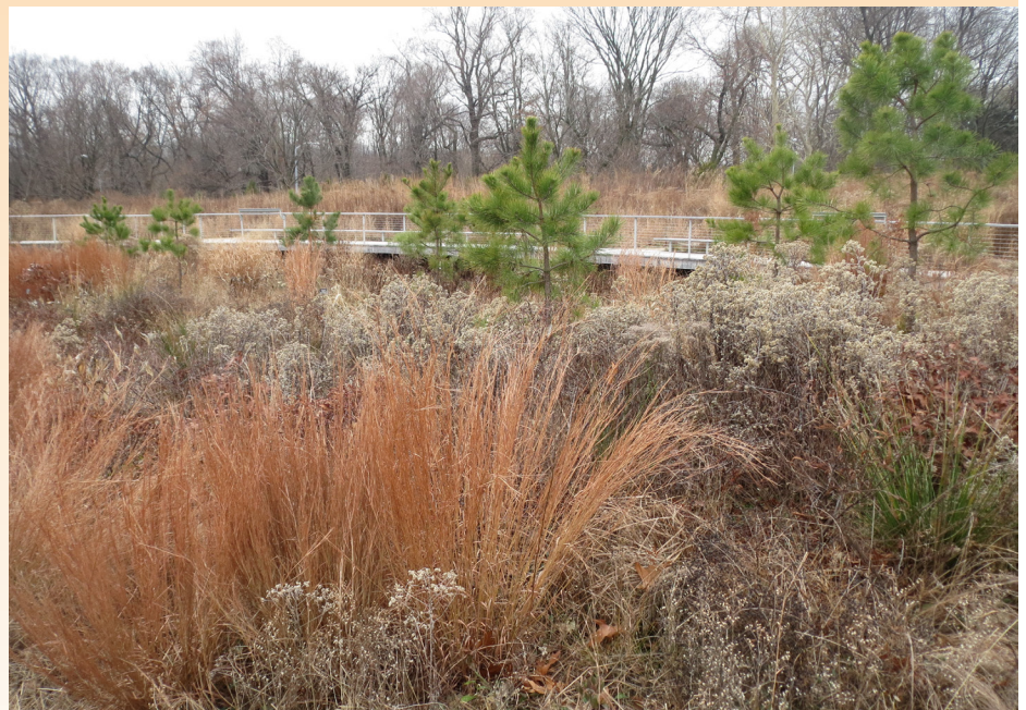
Native Flora Garden Extension, Brooklyn Botanic Garden, in December.